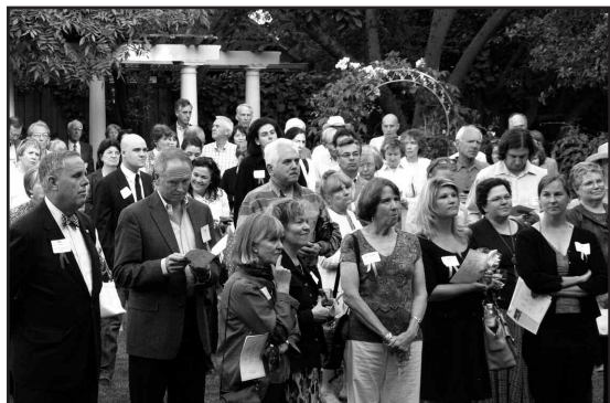
Grant recipients, donors, and friends of PACF listen to presentations at the Spring Grants Reception. For more photos and grant descriptions see - http://www.paloaltocommfund.org .

This year, the Fund awarded over $165,000 to the 23 organizations listed in the blue sidebar (right). Grantees, donors, board members and community friends celebrated at the Spring Grants Reception on May 24. Inspiring remarks from a few of the grant recipients followed the presentation of grants.